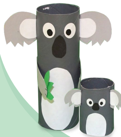
Paper Roll Koalas