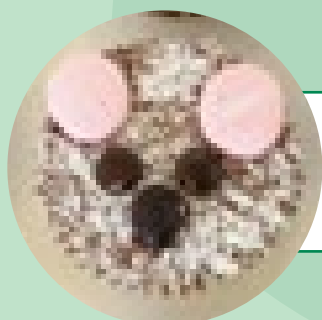
Koala Lamington cupcakes