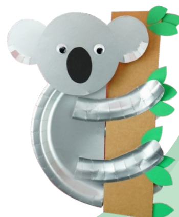
Koala Paper Plates