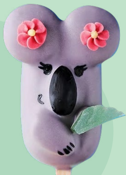
Koalas cake Pops